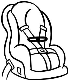
A forward-facing safety seat*